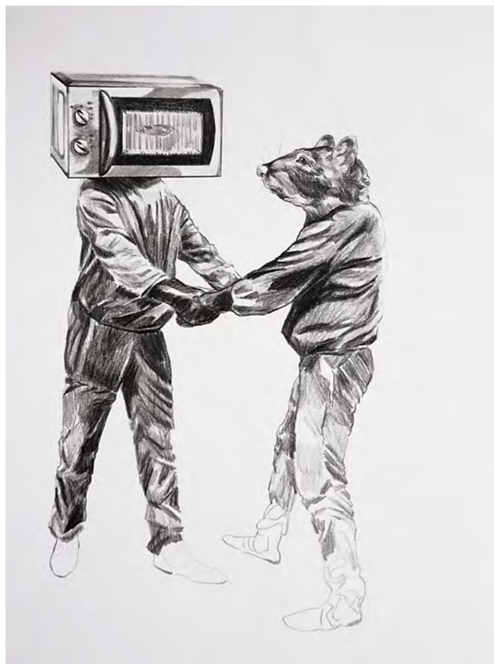
Yes, we can Pencil 30 x 20 cm 2015 Courtesy the artist

Next page: Anti-cauchemar Oil on canvas 50 x 50 cm 2018 Courtesy the artist