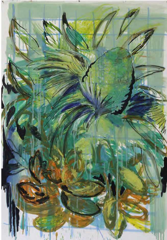
El llano Oil on paper 100 x 70 cm 2019