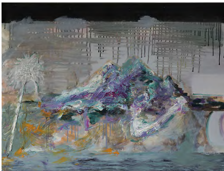
Previous page: The island series Oil on canvas 40 x 50 cm 2019