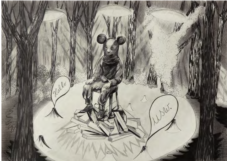
Previous page: Walsrode Oil on canvas 145 x 195 cm 2015