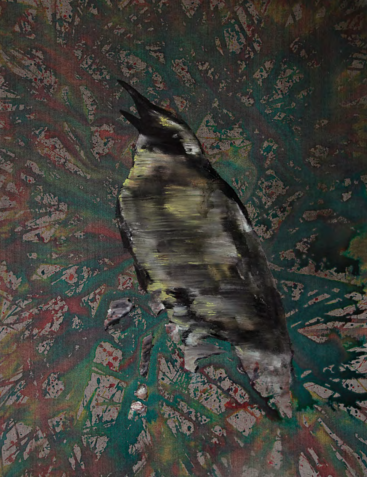
Blackbird Oil on canvas 90 x 70 cm 2015 Courtesy the artist

Next page: Femme engagée Oil on canvas 120 x 160 cm 2015 Courtesy the artist