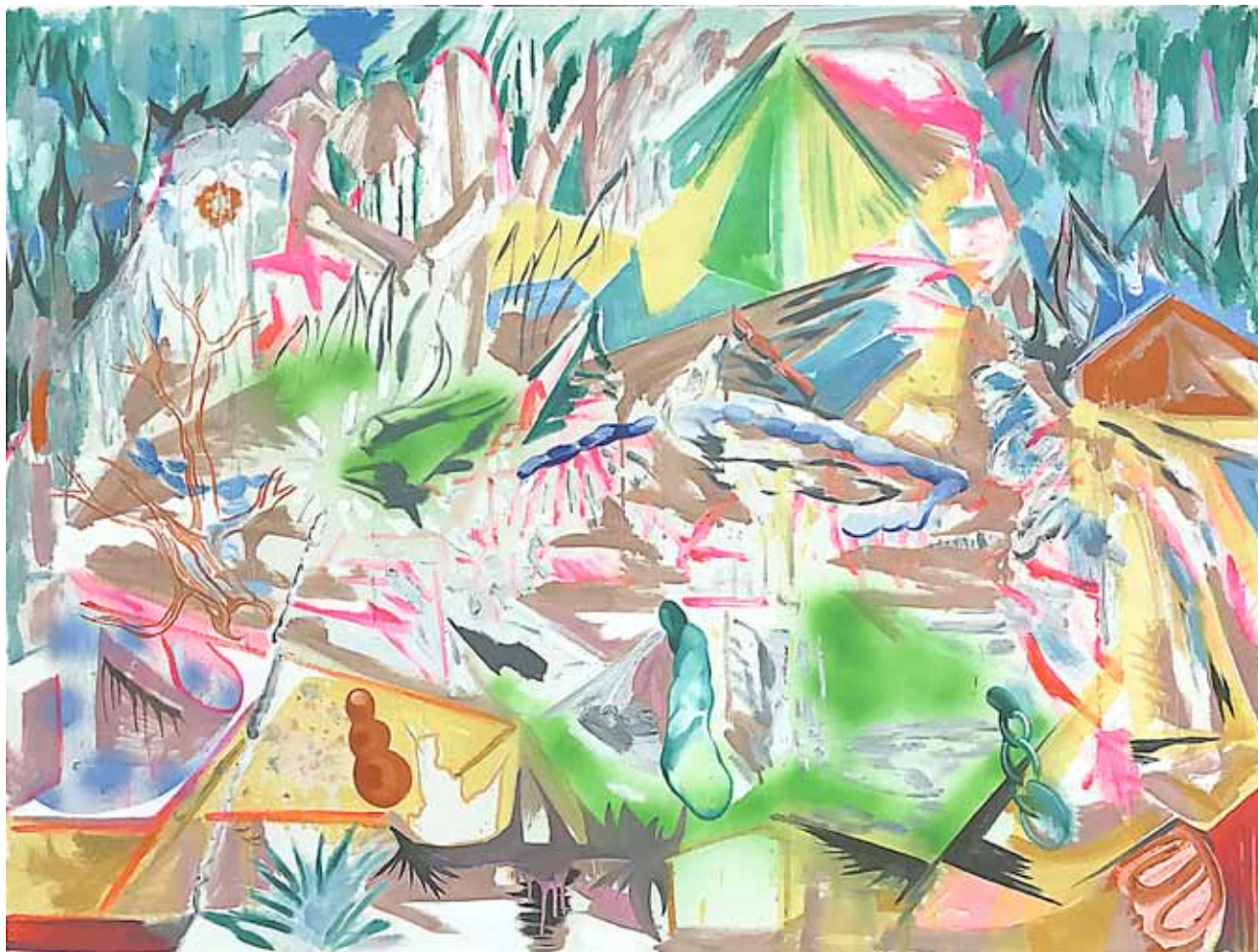
Alax Oil on canvas 160 x 200 cm 2022