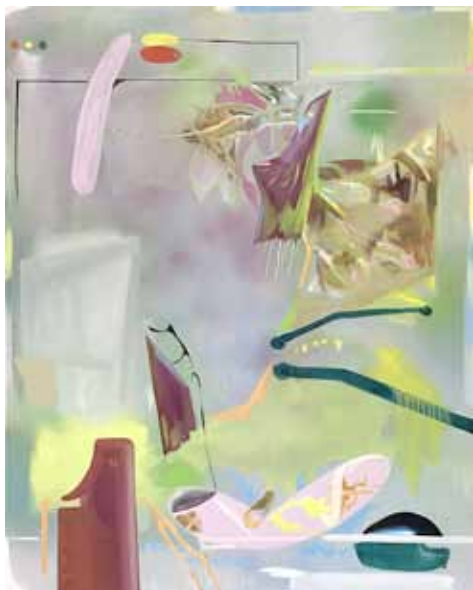
Pastorale Oil on canvas 150 x 120 cm 2021 Courtesy the artist