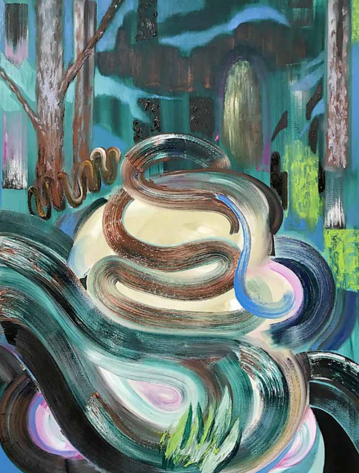
Losung Oil on canvas 160 x 120 cm 2021 Courtesy the artist

Next page: Girl with funny hair Oil on canvas 50 x 40 cm 2021 Courtesy the artist