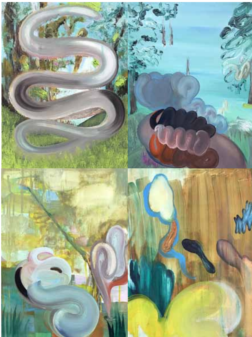
Study of a landscape Oil on wood 40 x 30 cm 2021 Courtesy the artist