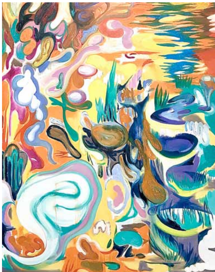
Biotop Oil on canvas 150 x 120 cm 2022