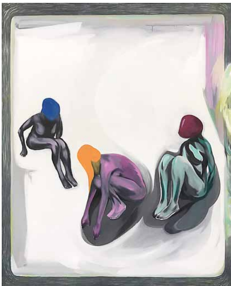
Zero Oil on fabric 160 x 130 cm 2020