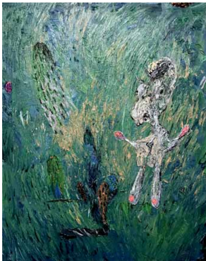
Previous page: Mycel Oil on fabric 120 x 100 cm 2023 Courtesy the artist