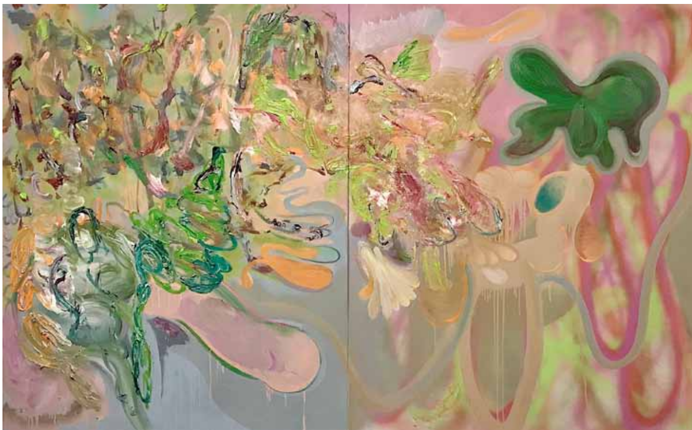
Eden Oil on fabric 150 x 240 cm, two parts 2023