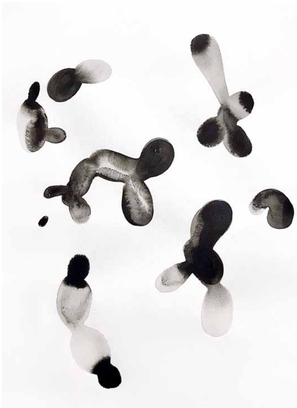
Erogen Indian Ink on French Arches 80 x 60 cm 2023