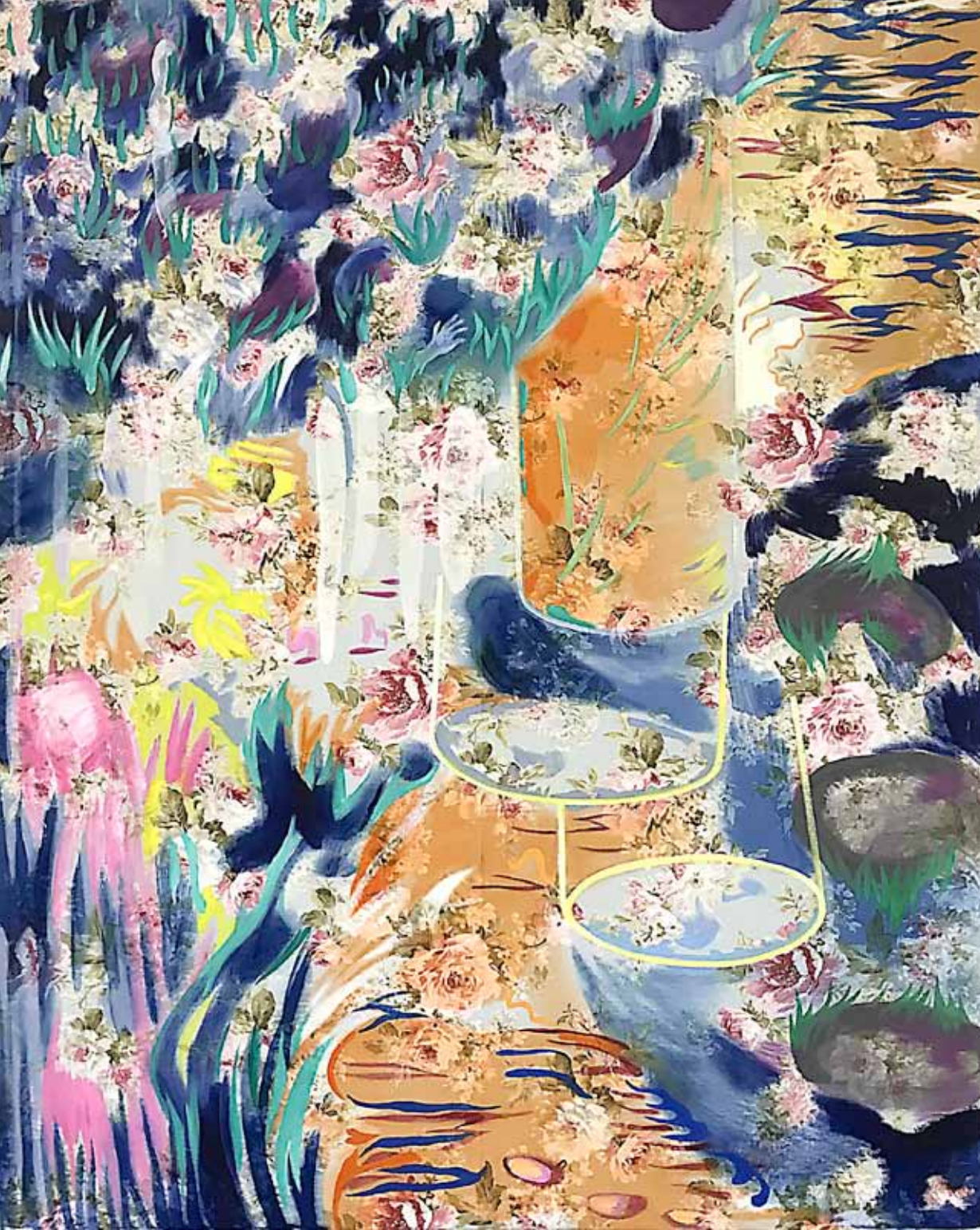
Reset Oil on Print 150 x 120 cm 2021 Courtesy the artist

Next page: Spiegelung Oil on fabric 120 x 100 cm 2020 Courtesy the artist