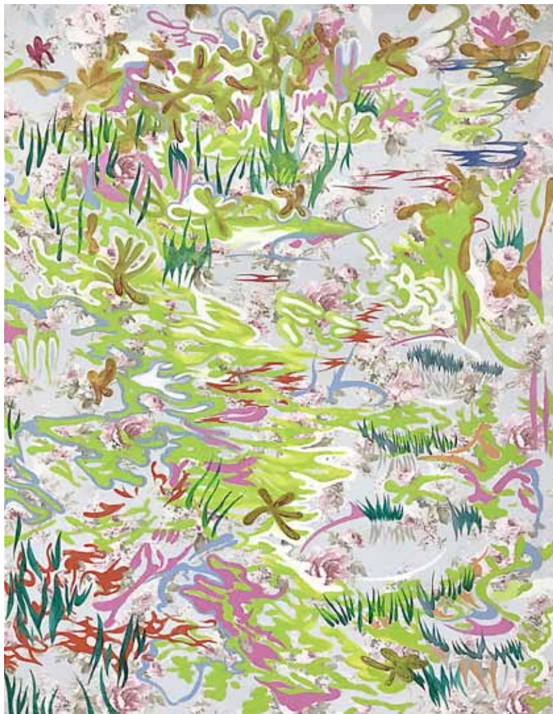
Waterlilies Oil on fabric 170 x 140 cm 2021 Courtesy the artist

Next page: Woman in veneers Oil, spraypaint on fabric 150 x 120 cm 2021 Courtesy the artist