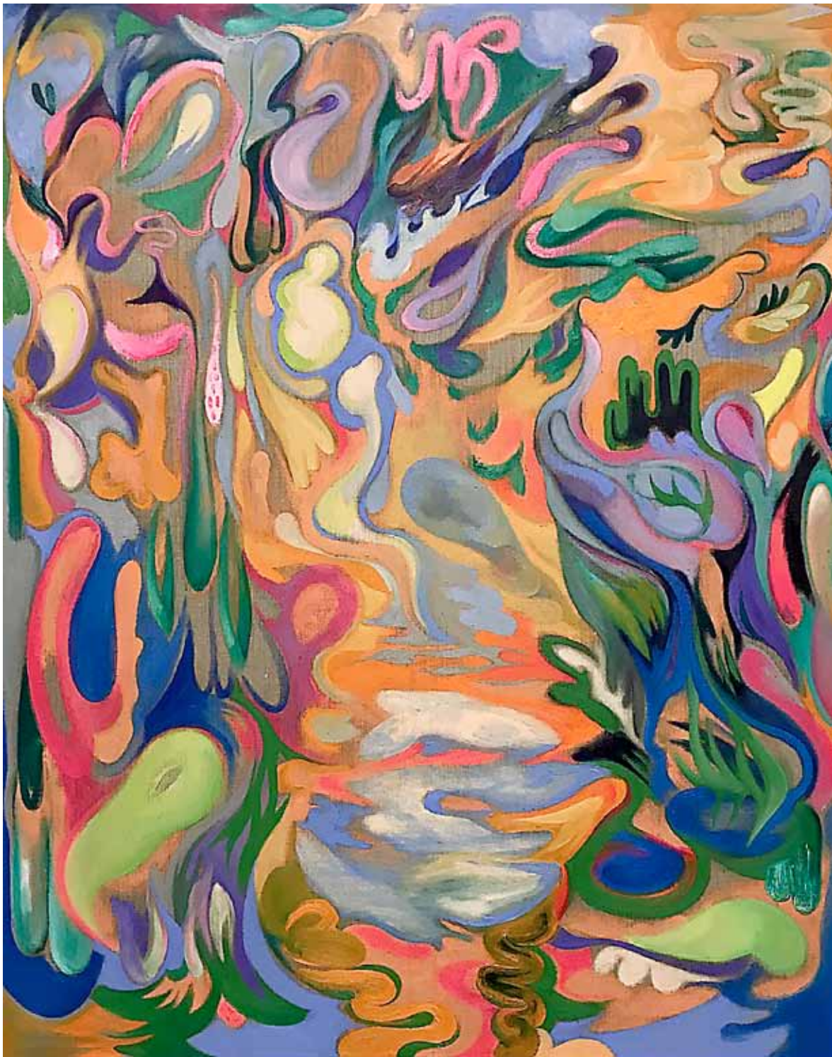
River Oil on canvas 150 x 120 cm 2023