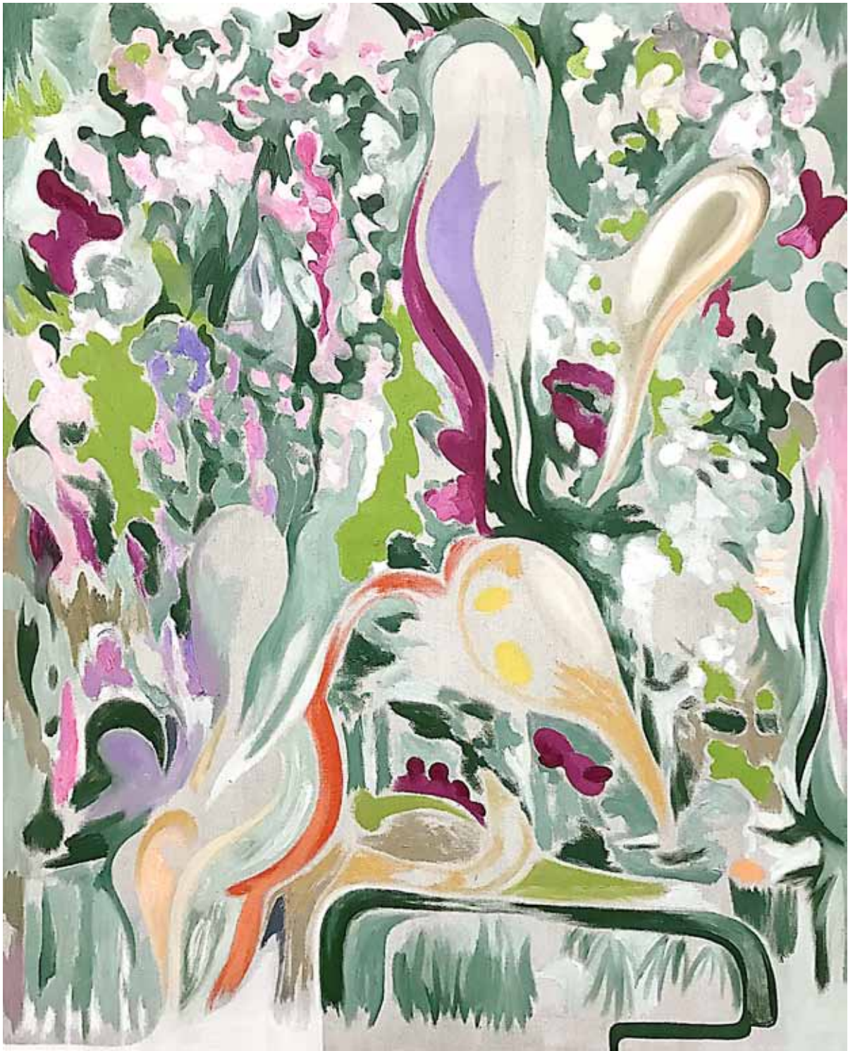
Playground Oil on canvas 150 x 120 cm 2023 Courtesy the artist