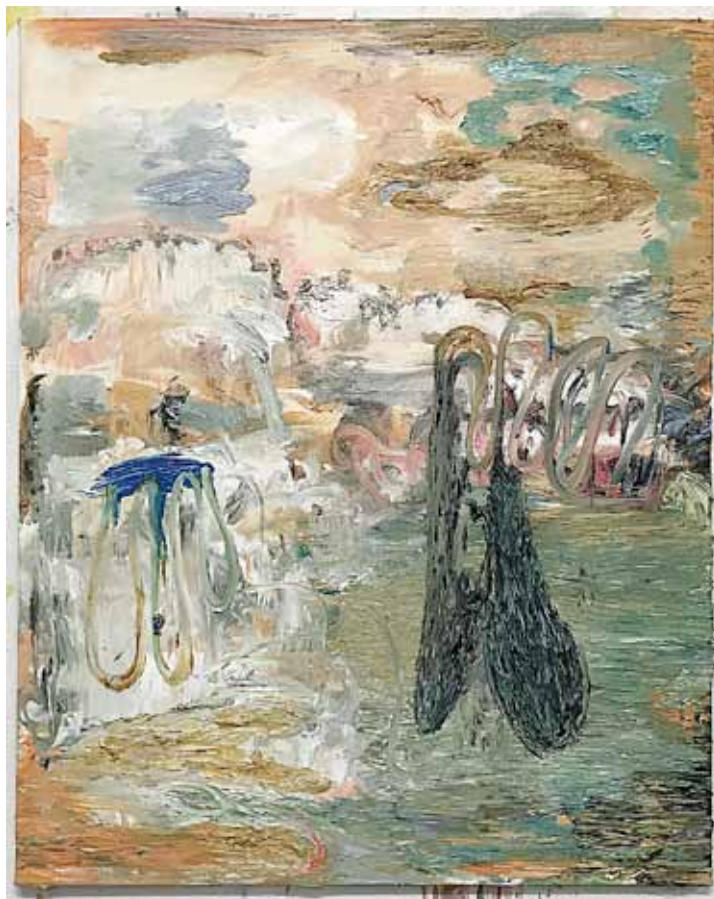
Little Horse Oil on fabric 120 x 100 cm 2023