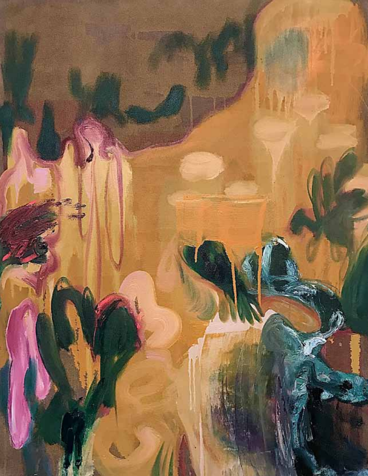
Der Pfad Oil on fabric 90 x 70 cm 2023 Courtesy the artist