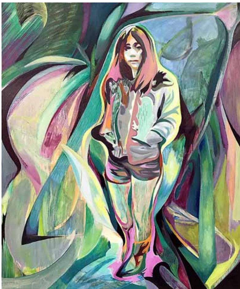
Previous page: Liquid Garden Oil, spraypaint, crayon on canvas 150 x 120 cm 2023 Courtesy the artist