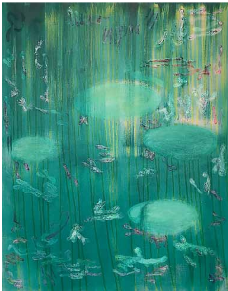
Feen Oil on fabric 90 x 70 cm 2023 Courtesy the artist

Next page: Die Schleiche Oil on fabric 150 x 120 cm 2023 Courtesy the artist