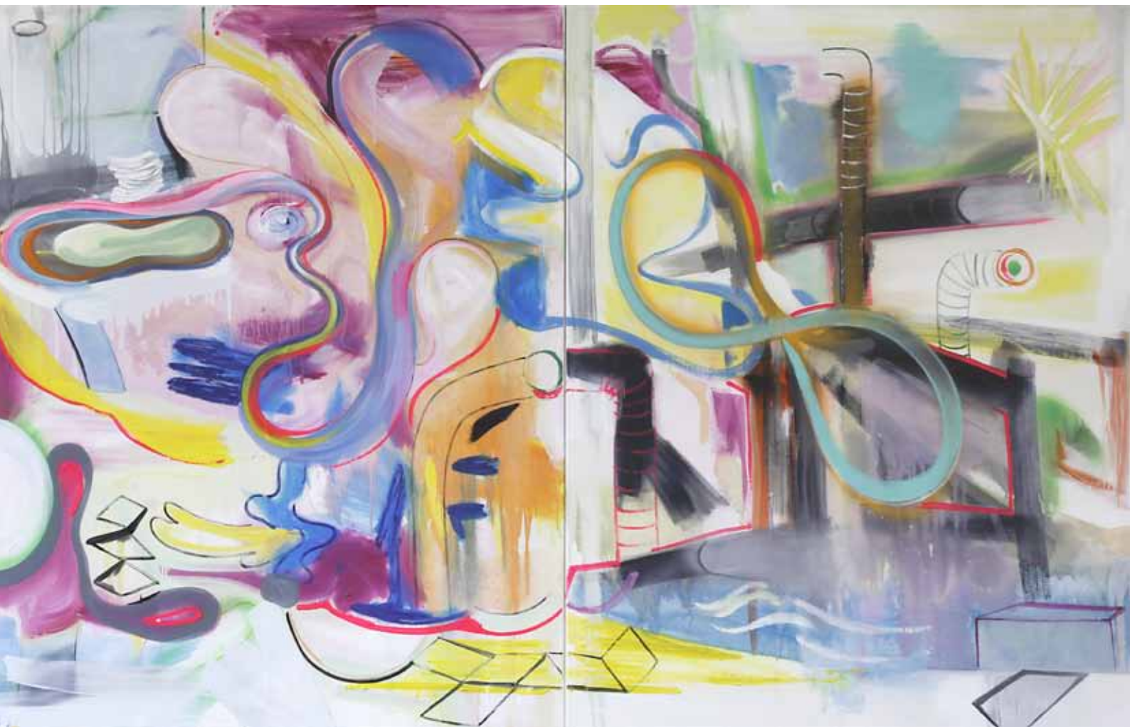
Next page: Der Park Oil on canvas 120 x 100 cm 2021 Courtesy the artist