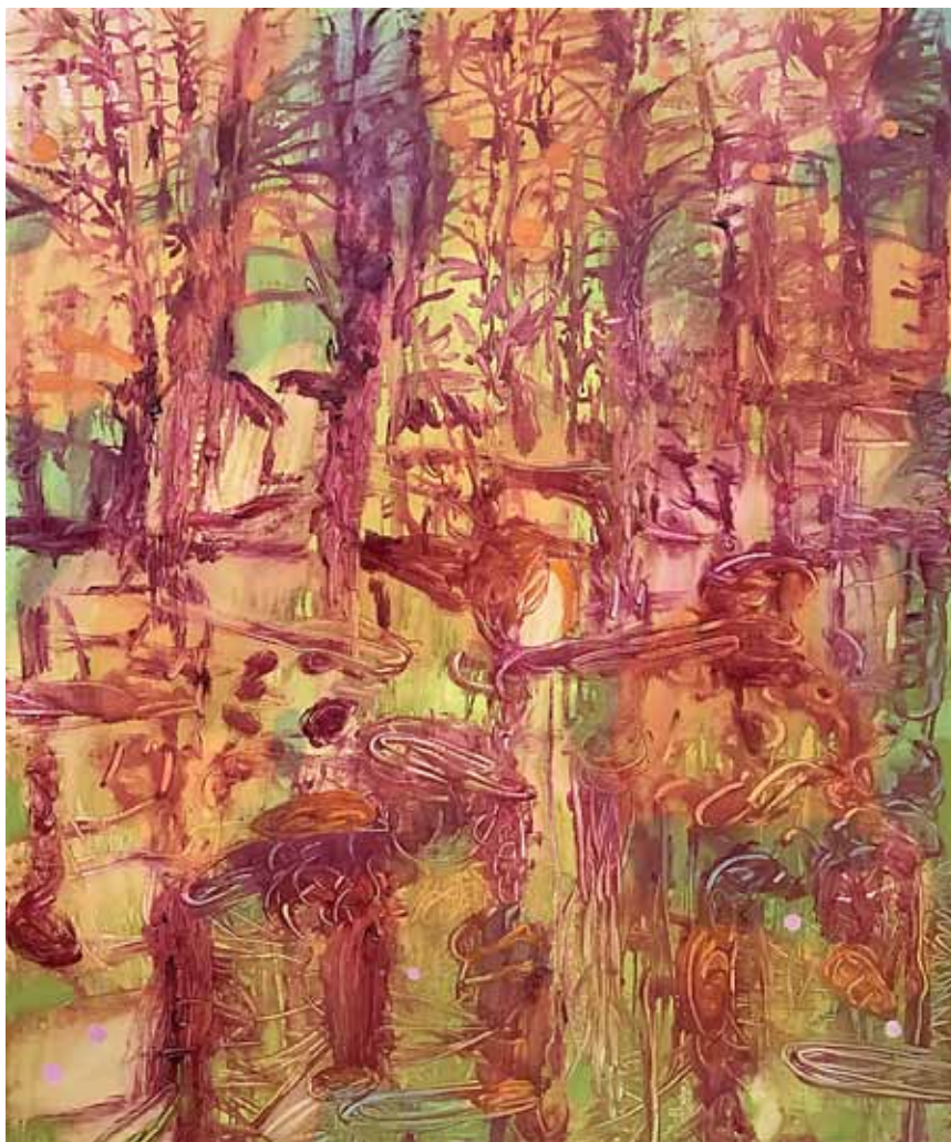
Bäume Spiegelung Oil on canvas 150 x 120 cm 2021 Courtesy the artist