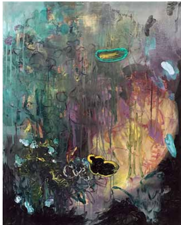
Above: Der Garten Oil on canvas 100 x 80 cm 2020