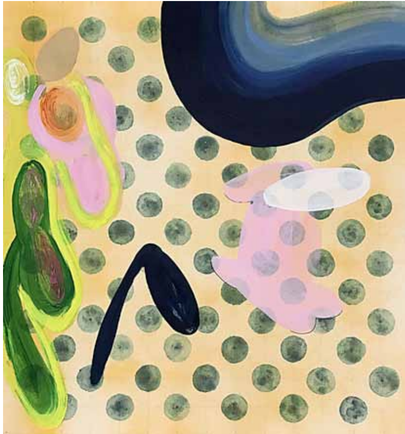
Die Welle Oil, watercolour, pencil on paper 40 x 30 cm 2021 Courtesy the artist

Next page: Biotop Oil on canvas 150 x 120 cm 2022 Courtesy the artist