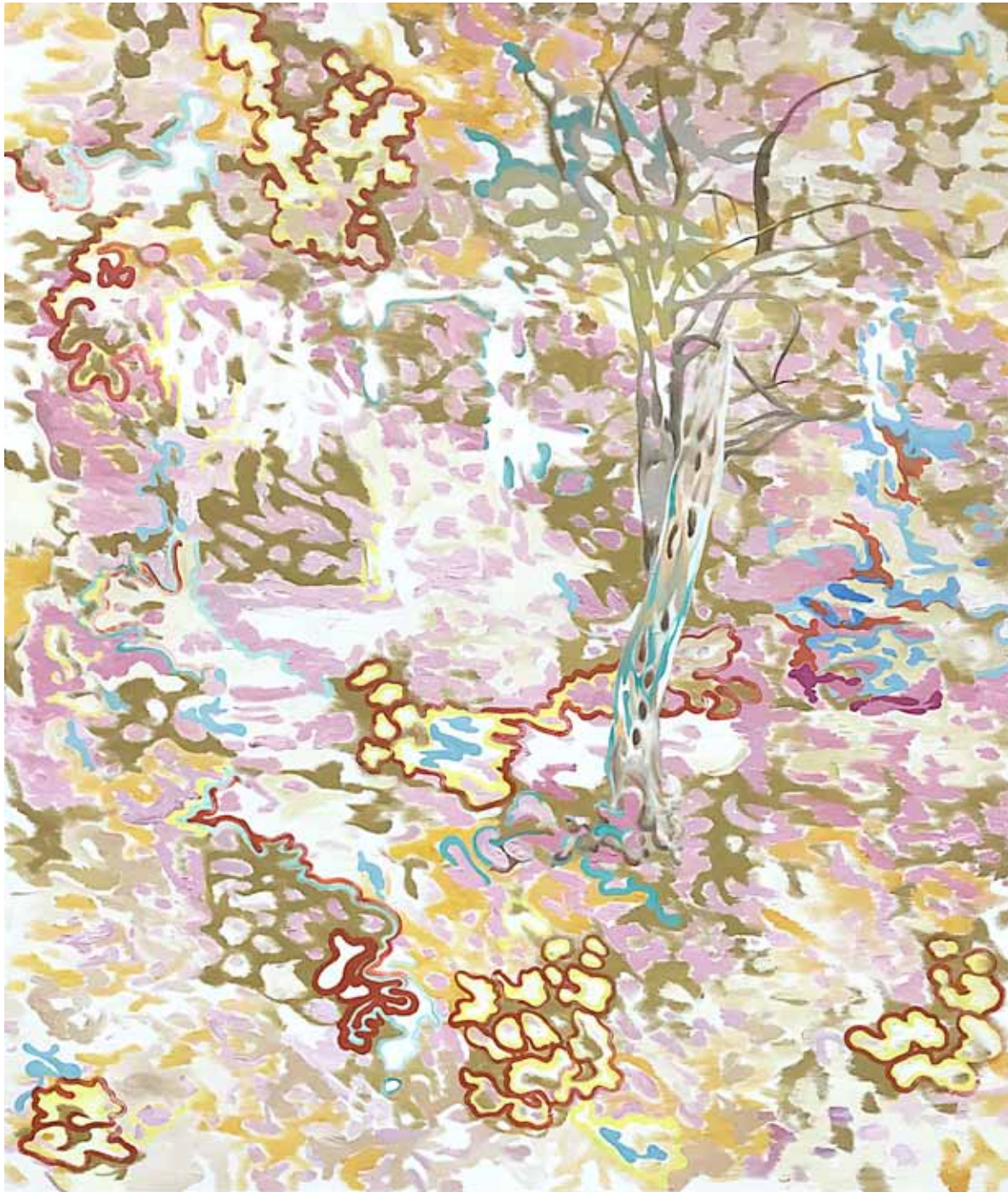
Liquid summer Oil on canvas 200 x 170 cm 2022 Courtesy the artist

Next page: Golf Oil on canvas 120 x 100 cm 2021 Courtesy the artist