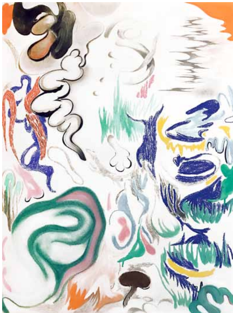
Biotop Charcoal, pastel and oil on paper 80 x 60 cm 2022 Courtesy the artist

Next page: Vertical garden Oil, coloured pencil on canvas 150 x 120 cm 2022 Courtesy the artist